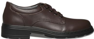
BROWN 170 – INDENT ONLY WIDTHS: D,E,F,G