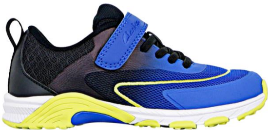
BLACK/BLUE MULTI NEW