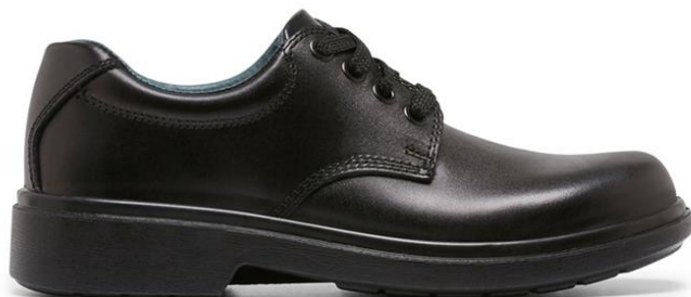
BLACK 028 - Widths: C,D,E,F,GH, *15 UK – E & F ONLY