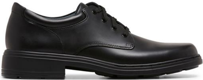
BLACK 028 -Widths: C,D,E,F,G

Upper: LEATHER Lining: LEATHER Sock: LEATHER Sole: PU