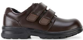
BROWN 170 – INDENT ONLY