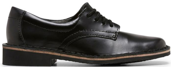
BLACK HI-SHINE B19

Upper: LEATHER Lining: LEATHER Sock: SYNTHETIC Sole: RUBBER