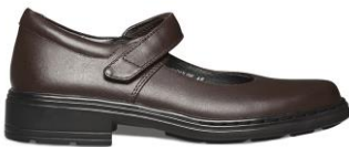
BROWN 170 – INDENT ONLY Widths: E