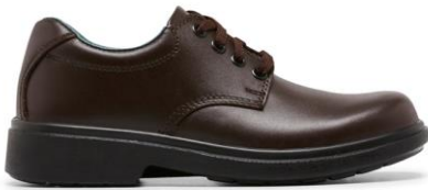
BROWN 170 – INDENT ONLY WIDTHS: D,E,F,G