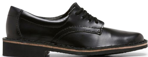
BLACK HI-SHINE B19

Upper: LEATHER Lining: LEATHER Sock: SYNTHETIC Sole: RUBBER