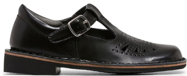
BLACK HI-SHINE B19

Upper: LEATHER Lining: LEATHER Sock: SYNTHETIC Sole: RUBBER