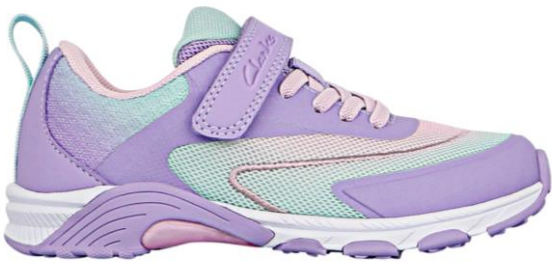
LILAC RAINBOW NEW