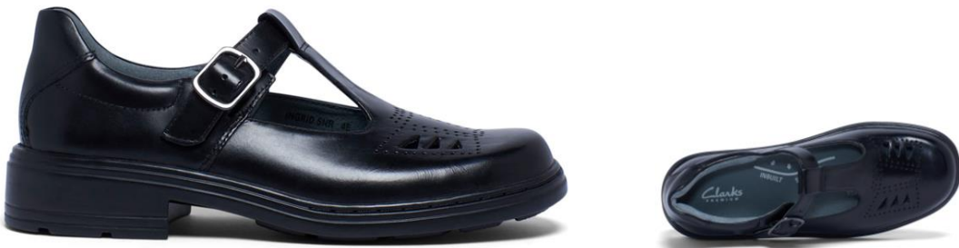
BLACK HI-SHINE B19