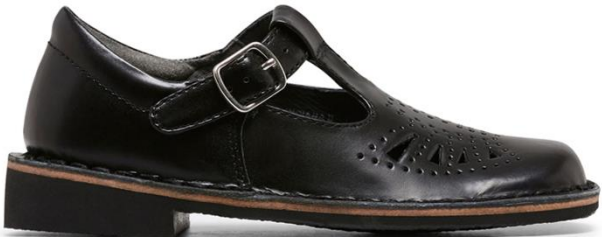
BLACK HI-SHINE B19

Upper: LEATHER Lining: LEATHER Sock: SYNTHETIC Sole: RUBBER