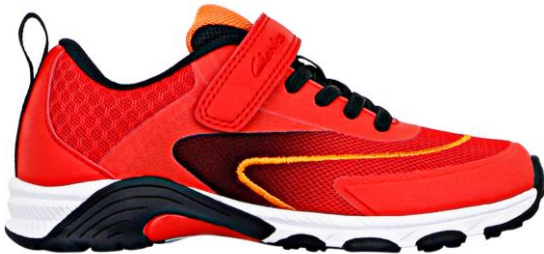
RED/BLACK MULTI NEW