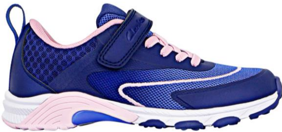
NAVY/PINK MULTI NEW