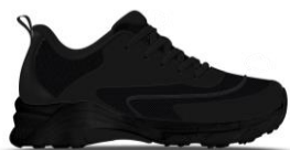
NOTORIOUS Pg. 27