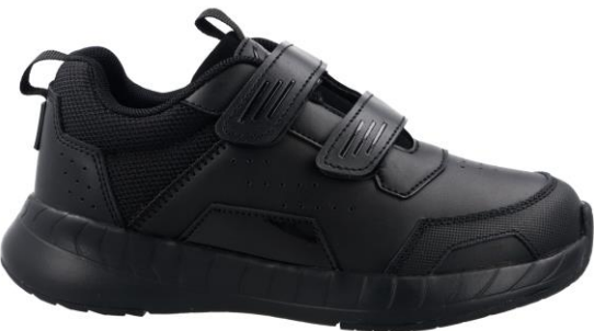
BLACKOUT ISG NEW