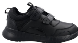
HENRIK Pg. 27