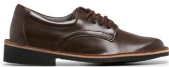
BROWN HI-SHINE AWM INDENT ONLY