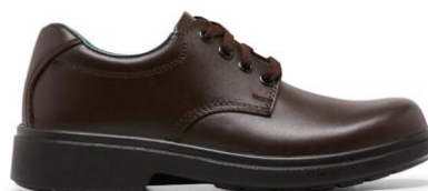
BROWN 170 – INDENT ONLY Widths: D,E,F,G *15UK – E & F ONLY