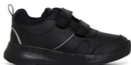
HUSTLE Pg. 29